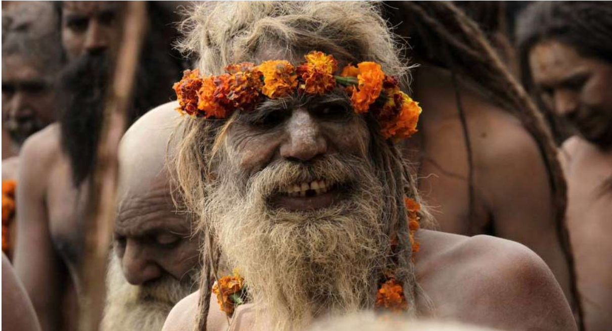
Gurus have their own spiritual commune with communications from a distance as well as correlations of the ways of energies.

It must become understood that our life is the result of a complexity and simultaneously a series of active laws that act upon what we call life, so it is impossible for us to understand their ultimate purpose.