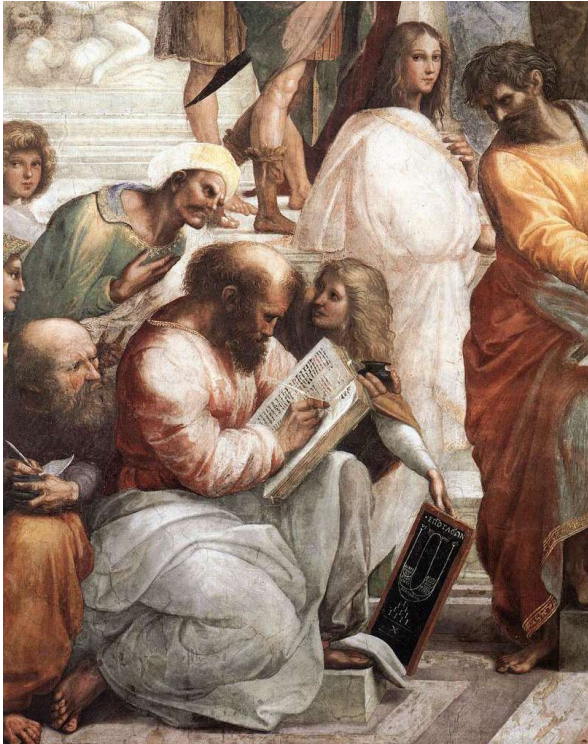
"Animals are relatives of humans, and man is a relative of God" Pythagoras was wont to say.

W e are born flooded with a multitude of recollections, with mysterious impulses and instinctive habits, sometimes for good, and sometimes for evil.