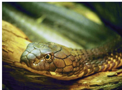
What was previously a person will be transformed into a wild animal, a reptile, while its indissoluble unit will begin again its painful new evolution ...

Did you ever think that if experimental science ever proved that indeed Reincarnation exists, what would be the future of humanity?